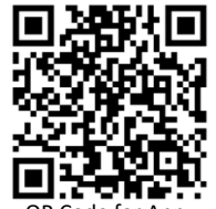
QR Code for App